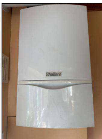
Image - 19 - Boiler

The heating and hot water are controlled by a Valiant boiler located in the kitchen. This is supplemented via a immersion located in the store cupboard on the 1st floor landing.