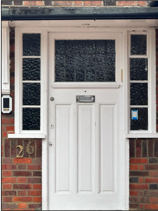
Image - 23 - Front door

Internally the doors appear in reasonable condition.