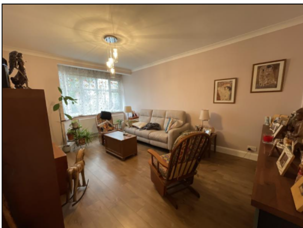
Image - 13 - Reception room at front of property