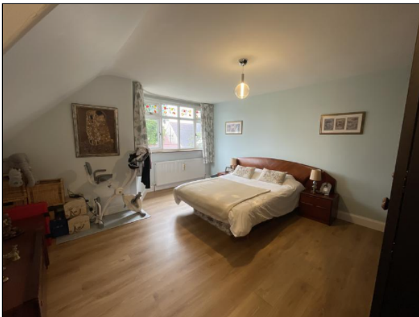
Image - 17 - Bedroom in loft conversion