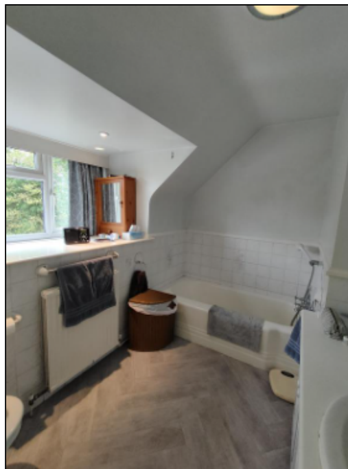
Image - 10 - Bathroom