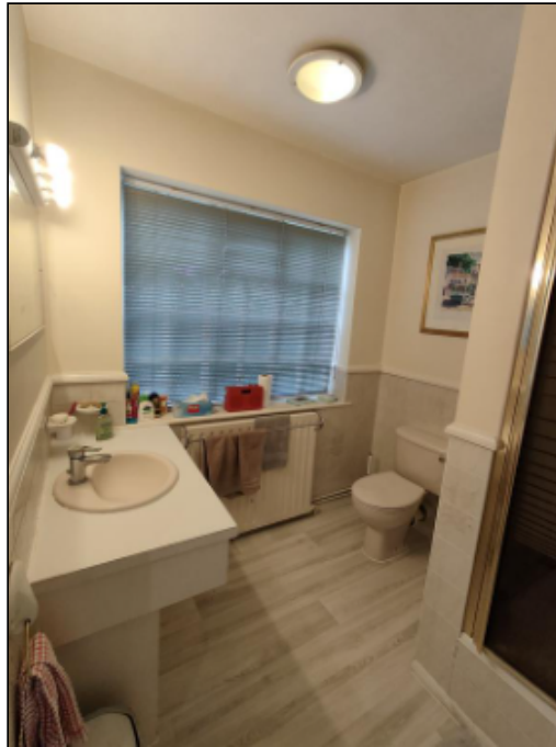
Image - 9 - En-Suite Shower Room