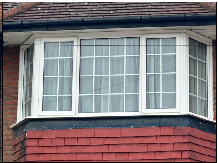
Image - 22 - Upper bay