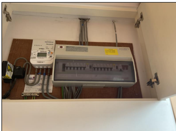
Image - 18 - Consumer Unit