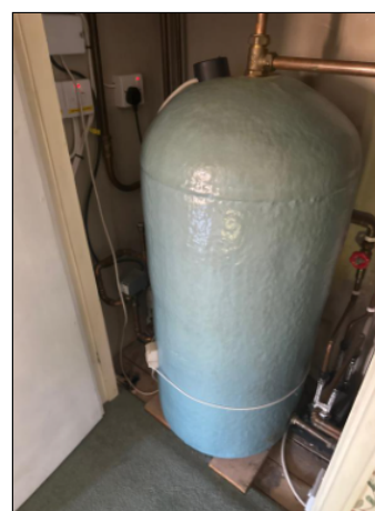
Image - 20 - Immersion tank