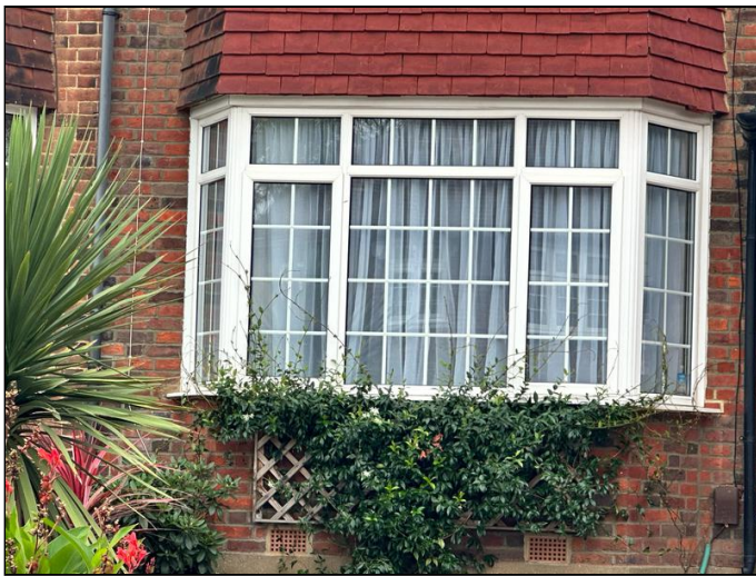
Image - 21 - Bay

There are bay windows to the following rooms: Reception room and Double bedroom.