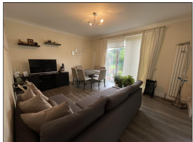
Image - 14 - Reception Room at rear of property